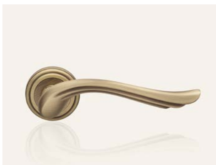
PM patiné patiné mat