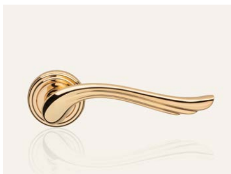
OZ oro zecchino gold plated