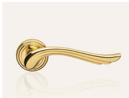
OL ottone lucido verniciato polished brass