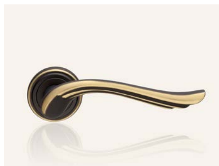
BM bronzo opaco matt bronze