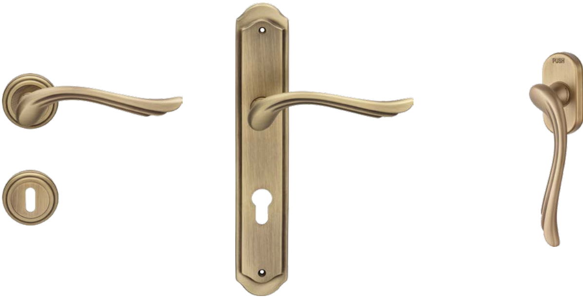
COD. 1630 RB 011