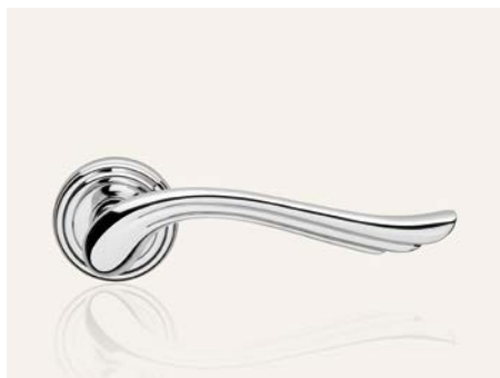
CR cromo lucido polished chrome